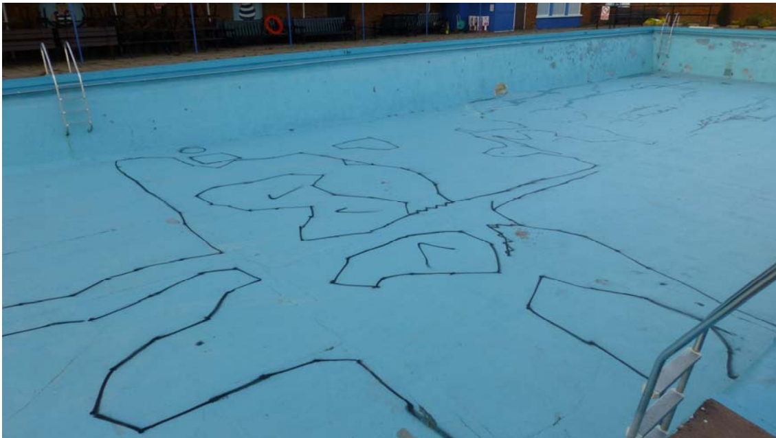
Identifying the de-bonded areas, the ticked sections were ok