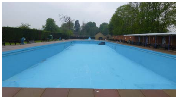
Finally the task of hand painting the pool was aided by a working party from Cummins Stamford