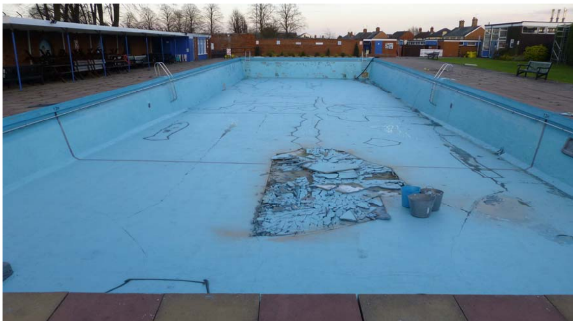
Work begins removing the be-bonded areas